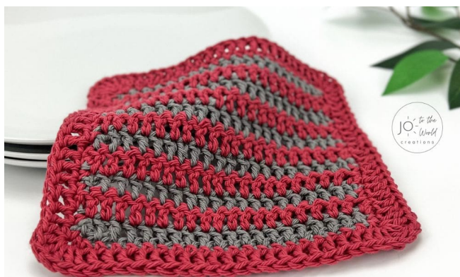
Dishcloth made with two colors. I used grey for the Chain Row and Rows 1, 3, 5, 7, 9 & 11 and red for Rows 2, 4, 6, 8, 10 & the border.