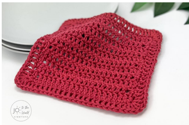
Dishcloth made with one solid color

Change colors after finishing a row by placing the new color on your hook and pulling the new color through the loop of your current color. Fasten off the old color. With your new color, ch 1 and begin the next row.