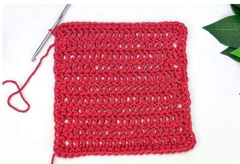
Dishcloth after Border Round 1 Completed.

At the bottom (1st) corner, make 3 sc into the corner st. Sc across the bottom. At the next (2nd) corner, make 3 sc into the corner st. Sc up the side: make 1 sc into the 1st turning ch after the 2nd corner. *Make 1 sc into the side of the end dc st. Working into the side of the turning ch, make 1 sc near the bottom and 1 sc in near the top.* Repeat from * to * up the side. At the next (3rd) corner, make 3 sc into the corner st. Sc across the top. At the last (4th) corner, make 3 sc into the corner st. When back where you started, sl st into 1st sc to join.